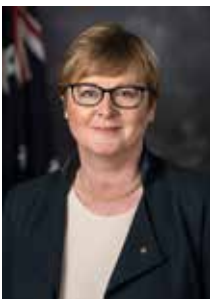
Senator the Hon Linda Reynolds CSC Minister for Defence Industry

Realising the benefits of the Defence Policy for Industry Participation will be a shared undertaking between Defence and industry. We are committed to working together to ensure the investment decisions we make today help secure Australia’s national security and national prosperity for generations to come.