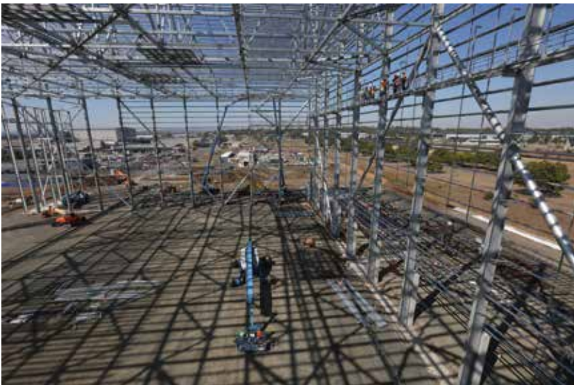
Overseeing construction of a dedicated C-17A maintenance hangar at RAAF Base Amberley Queensland