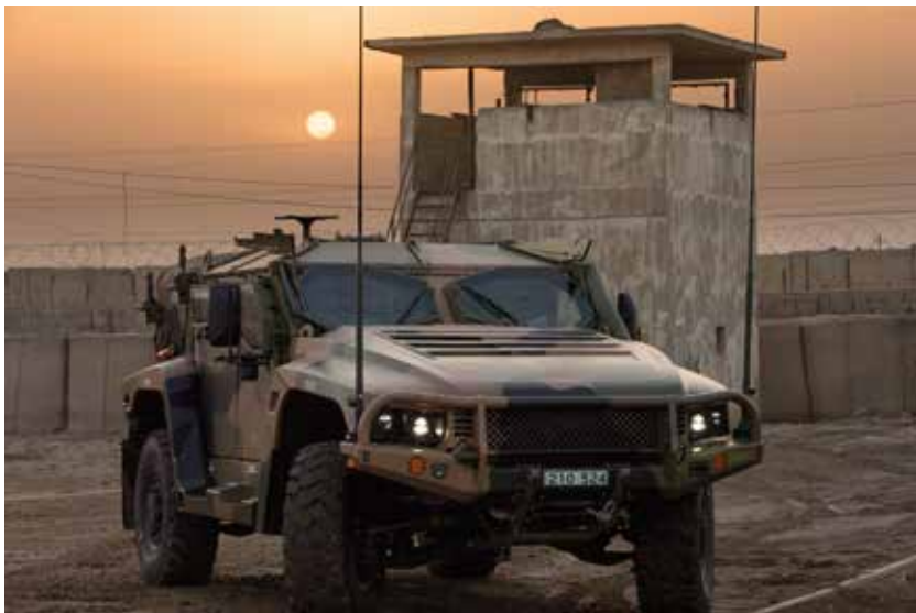
The Australian designed and manufactured Hawkei Protected Mobility Vehicle (light, four-door variant) undergoes trials at the Taji Military Complex, Iraq